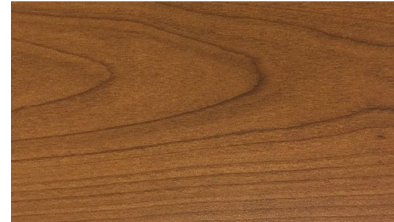
EUROPEAN CHERRY 1406/01L/1421-08F1 w/ 716