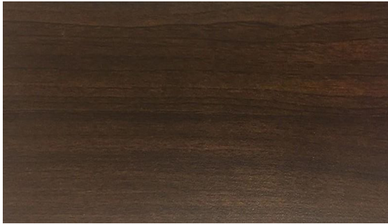
NATIONAL WALNUT 1806-02L/1806-02F5 w/ 733