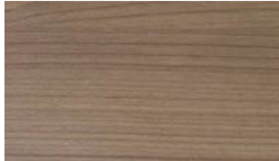
ASH 1406/01L/1421-08F1 w/ 737