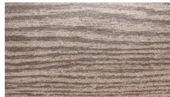
WEATHERED TEAK 2501/02 w/ 8G-148-A009