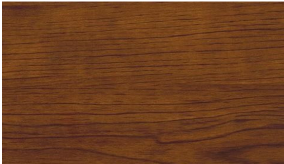
MEDITERRANEAN CHERRY 1403-01L/1424-06F5 w/ 716