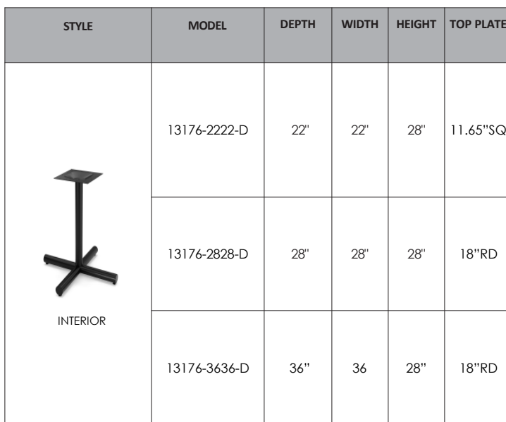
X Base - Dining