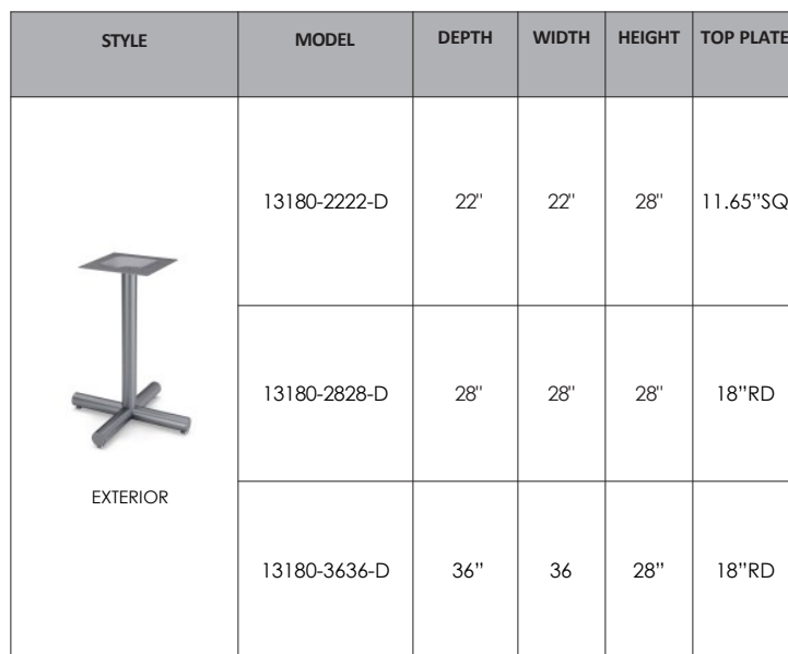
X Base - Dining