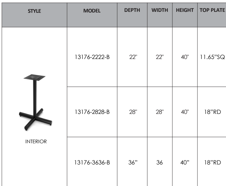
X Base - Bar