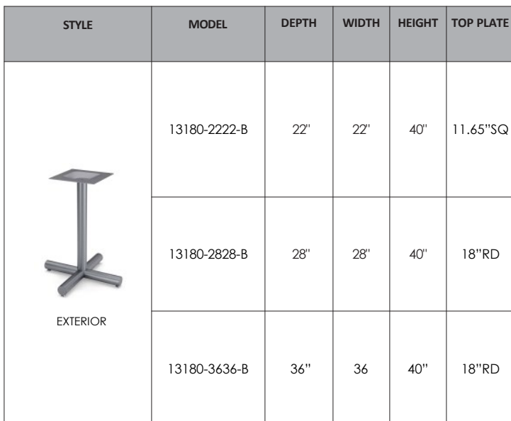
X Base - Bar