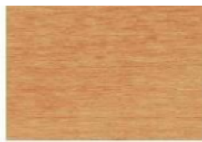
LIGHT CHERRY ON MAPLE (LCM)