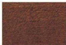
MEDIUM WALNUT ON MAPLE (MWM)