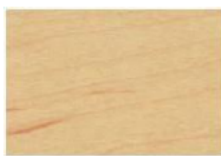
CLEAR MAPLE (CM)