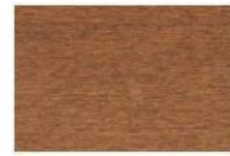
AMBER MAPLE ON MAPLE (AMM)