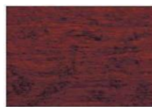
MEDIUM MAHOGANY ON MAPLE (MMM)