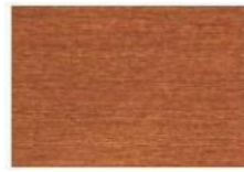
MEDIUM CHERRY ON MAPLE (MCM)