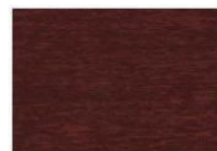
DARK MAHOGANY ON MAPLE (DMM)